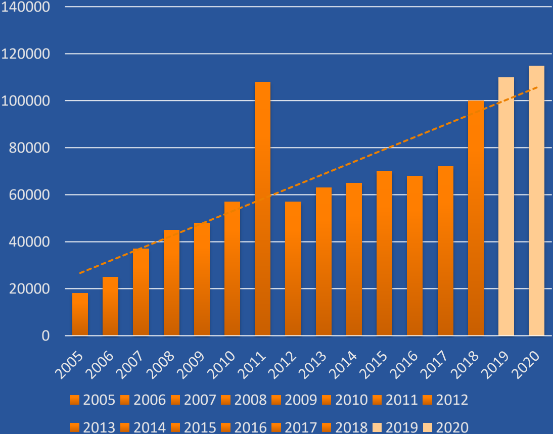
Number of pax/year