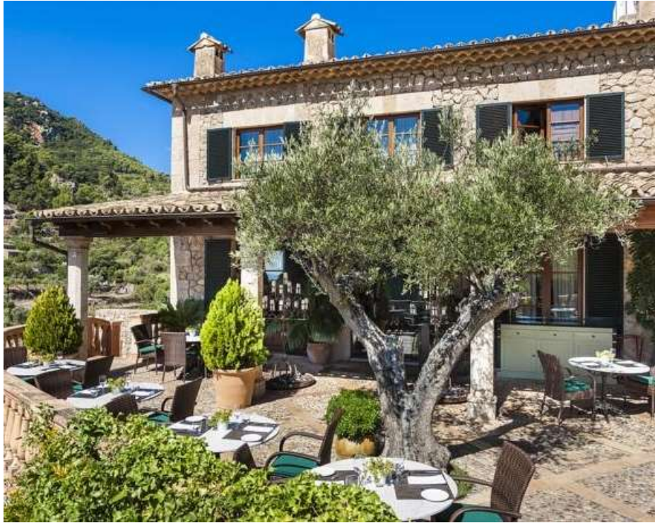
Creating an agrotourism business

Agrotourism is a quite new type of tourism in our country. The desire of the consumers to spend time on the nature, eat organic food and relax is giving this culture a great start-up. In this circumstances, creating more businesses based in agrotourism would be a smart investment.