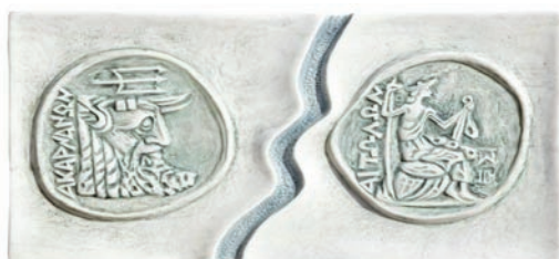
CHAMBER OF AETOLOAKARNANIA