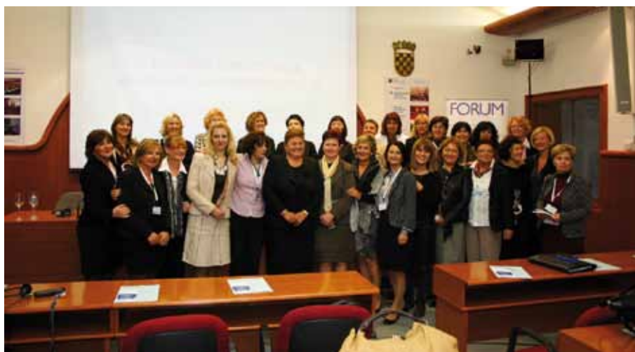
The participants to the 6 th women enterprises congress (Split 3 rd and 4 th november 2011)

More than 100 women enterprises of the Adriatic and Ionian area promote "networking" in Split