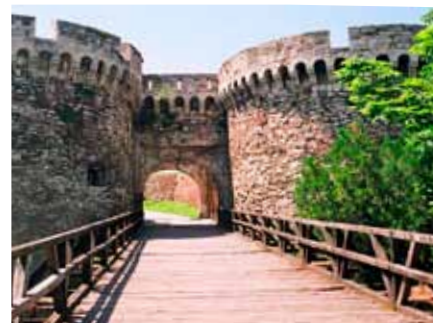
Views of Belgrade (Serbia)