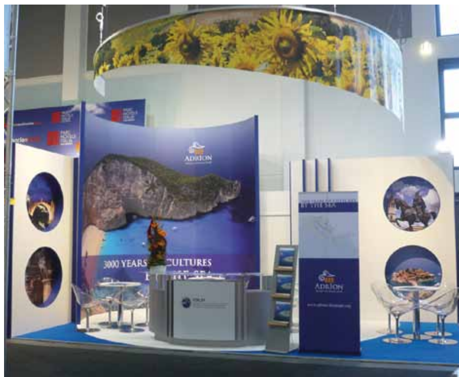
Above: booth of AIC Forum's Tourism Workgroup at ITB Berlin Fair, 10 th -14 th March 2010

Concluded the project's activities in 2011: important gained results and outputs