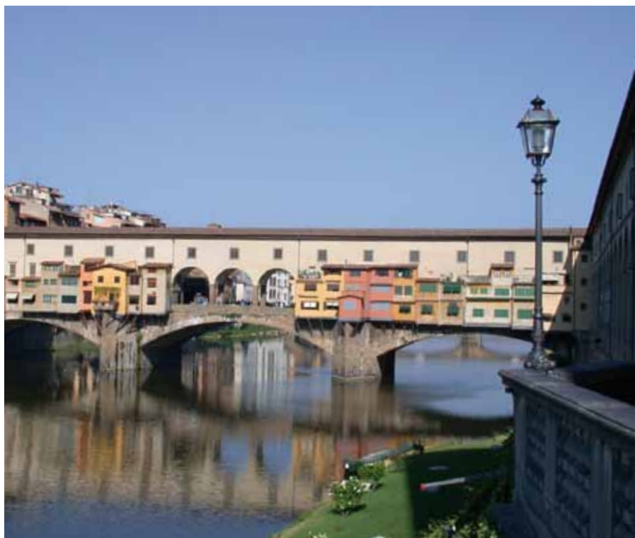
Florence: Old Bridge

New opportunities for the tourist promotion of the Adriatic and Ionian area