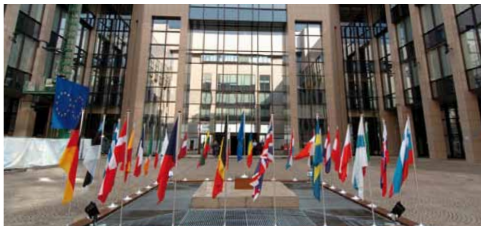
European Council in Brussels

On 18 November 2014 in Brussels the Conference to launch the Strategy for the Adriatic-Ionian Macroregion will take place, organised by the Italian Presidency of the Council of the European Union in collaboration with the European Commission, the Adriatic-Ionian Initiative and the Marche Region, the latter heading up the Intergroup Adriatic Ionian Committee of the Regions.