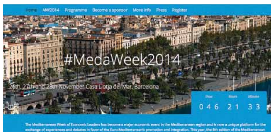
Poster of Mediterranean Week of Economic Leaders e Meditour 2014

8 th Edition of the Mediterranean Economic Event and 4 th Mediterranean Tourism Forum Meditour 2014 (Barcelona, 26 th -28 th November 2014)