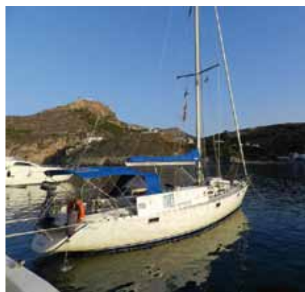
Sail boat of the project “Arina 2014”

The concluding event was held in Bodrum and Istanbul (Turkey) from 16 to 19 October when the project results were presented, including a Web guide with illustrations of the tourism package including all the cultural and tourism aspects of the localities along the Venetian routes.